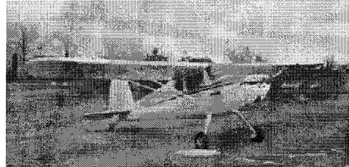
1948 Cessna 140 For Sale

Tuesdays eves. - 7:00 p.m. (Weather Permitting)