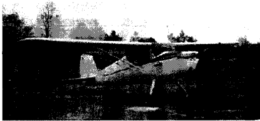
1948 Cessna 140