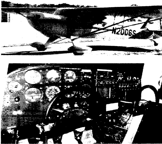
1983 Taylorcraft F21-A

Newly rebuilt engine, 4 hours since MO. Current annual. Interior good shape, needs headliner and some TLC. Asking $22,000 or best offer. Call Gayle (810) 733-6213