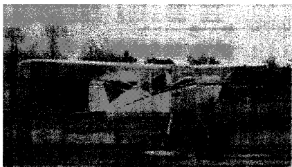
1948 Cessna 140

FOR SALE - House lot plus adjoining hangar lot fronting on Ann Drive, Dalton Airport, Flushing. (810) 820-0407 Doug Isham